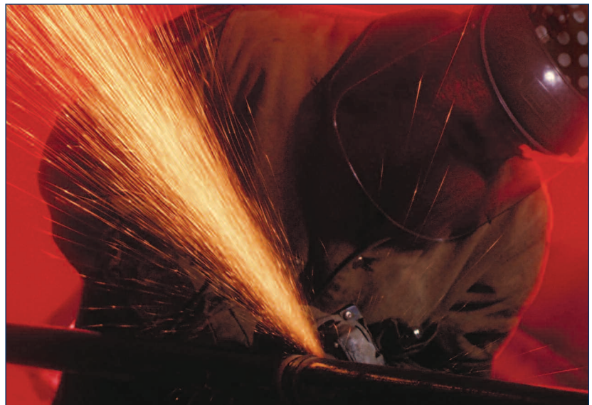
Tool maintenance and safe operating conditions can be monitored using HVM100